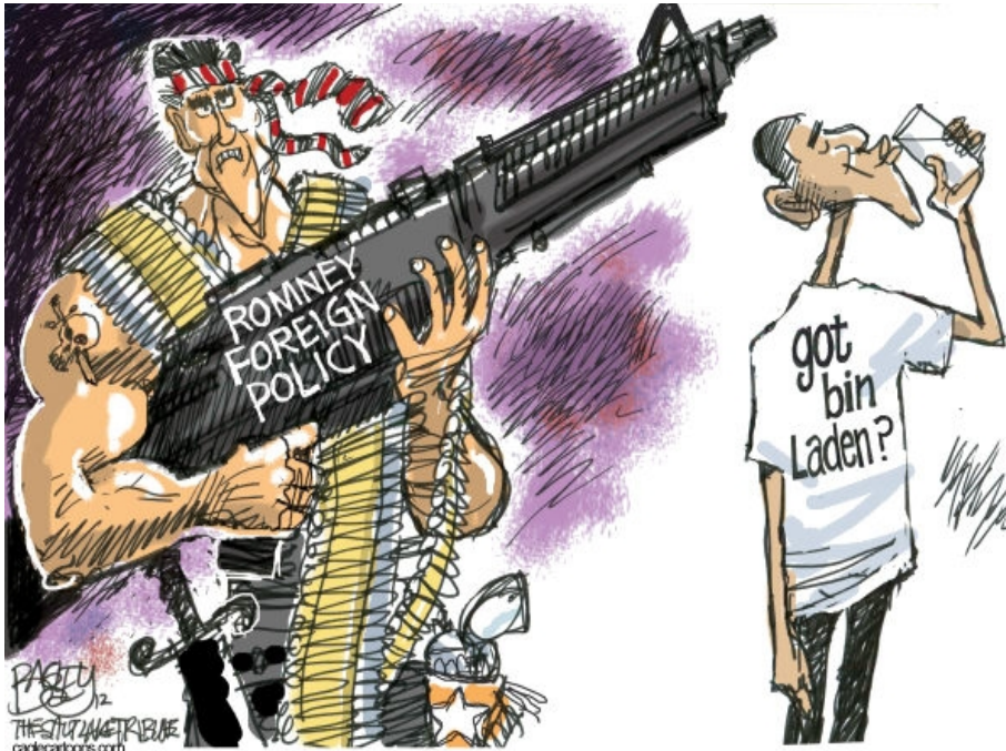
By Pat Bagley / Salt Lake Tribune, Courtesy Caglecartoons.com