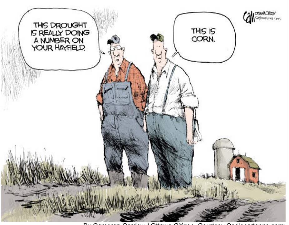
By Cameron Cardow / Ottawa Citizen, Courtesy Caglecartoons.com

Association of American Editorial Cartoonists http://editorialcartoonists.com/