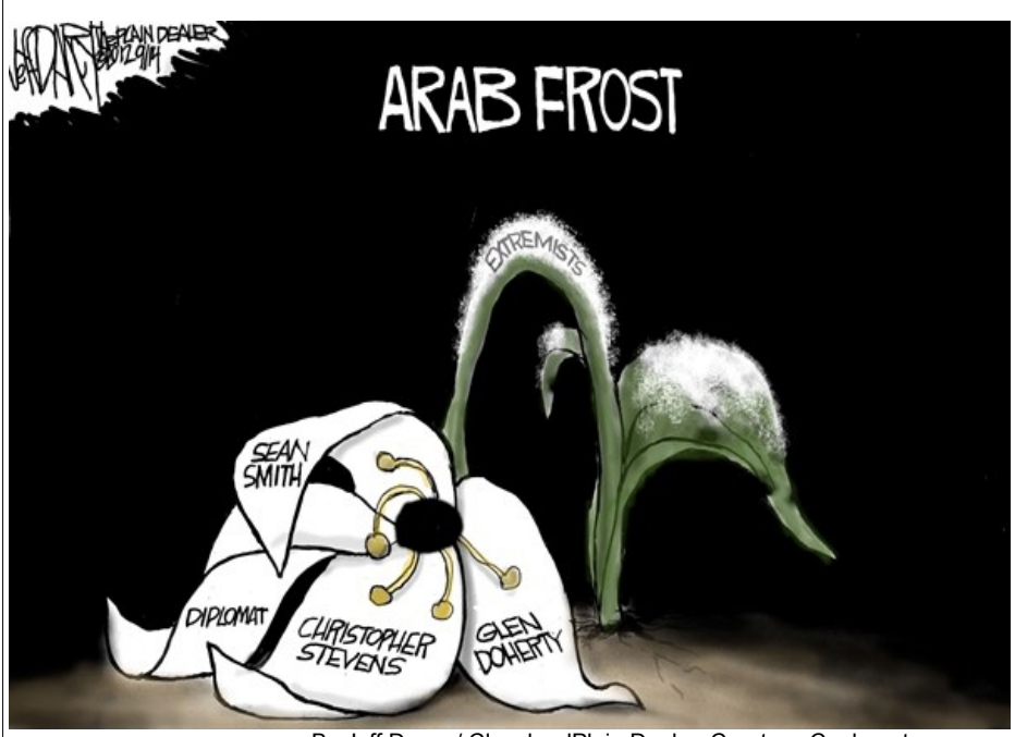
By Jeff Darcy / ClevelandPlain Dealer, Courtesy Caglecartoons.com