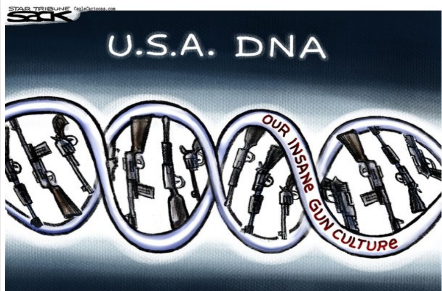
Steve Sack, Minneapolis Star Tribune / Courtesy of Cagle.com