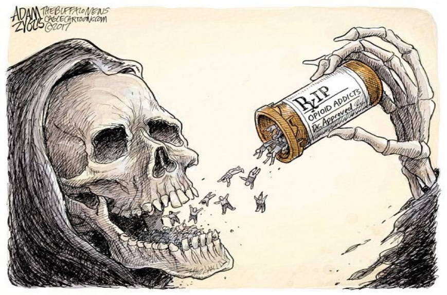
Adam Zyglis, The Buffalon News / Courtesy of AAEC