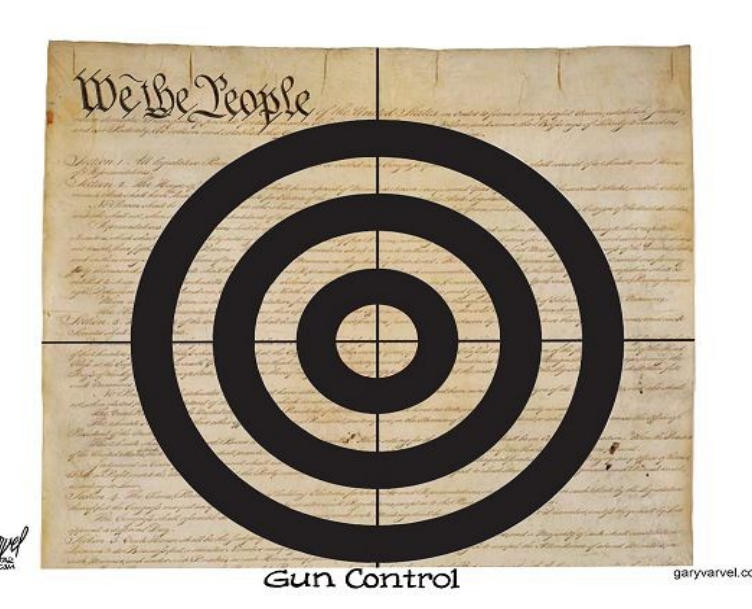
Gary Varvel, Indianapolis Star / Courtesy of AAEC.