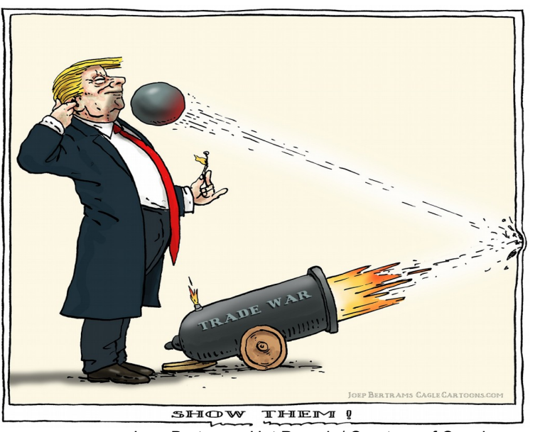
Joep Bertrams, Het Parool