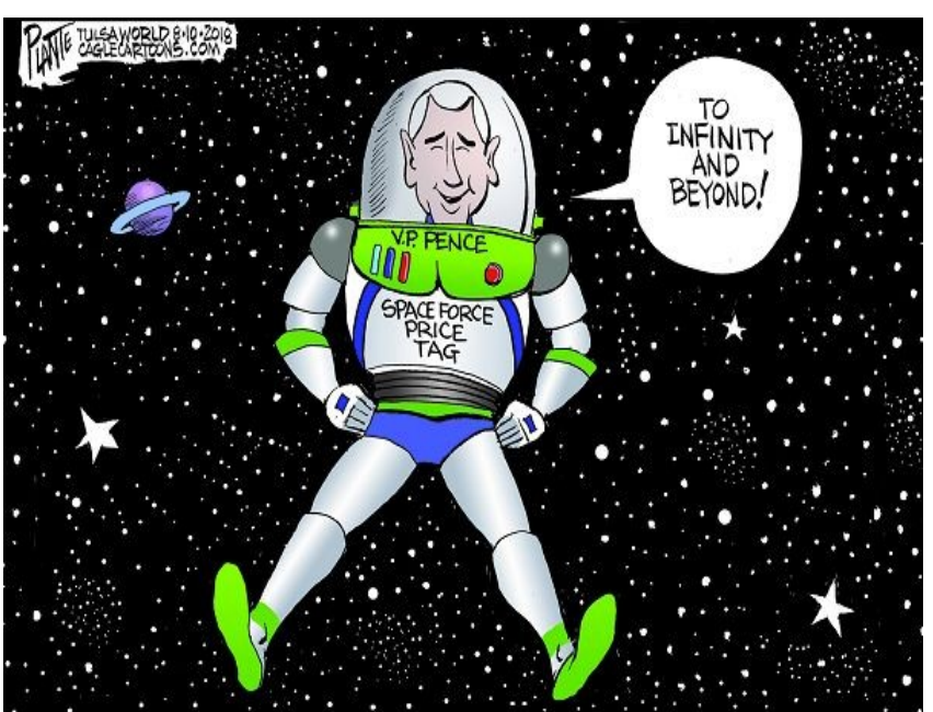
Bruce Plante, Tulsa World / Courtesy of AAEC