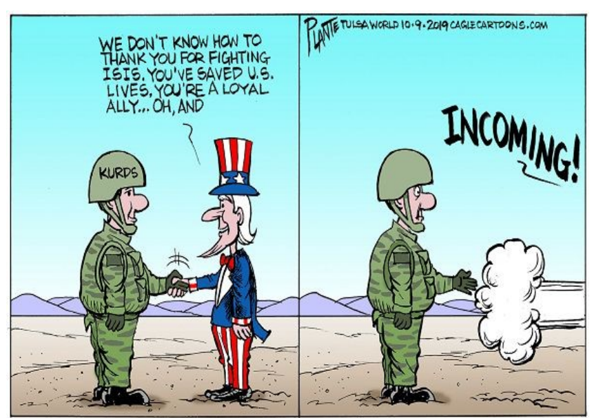
Bruce Plante, Tulsa World / Courtesy of AAEC