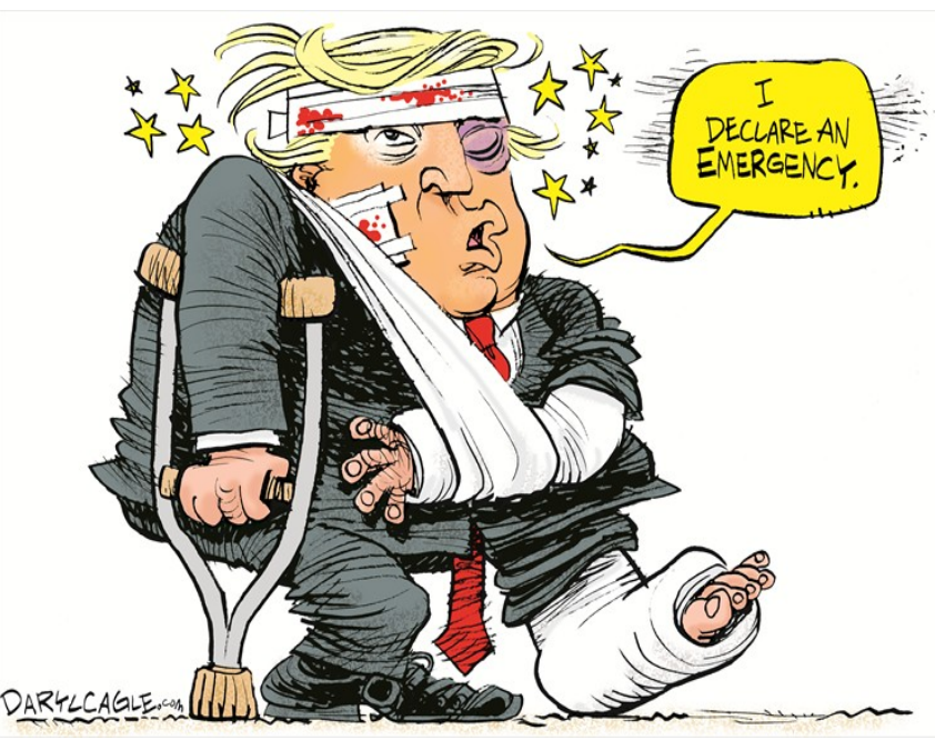
Daryl Cagle / Courtesy of Cagle.com