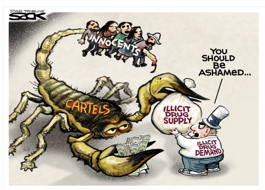
Steve Sack, Minneapolis Star Tribune / Courtesy of Cagle.com