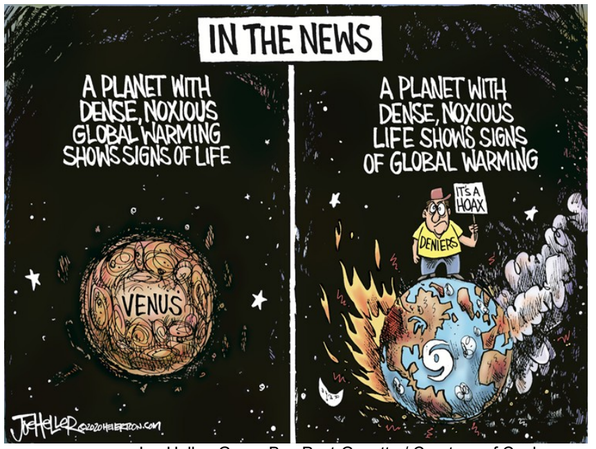
Joe Heller, Green Bay Post-Gazette / Courtesy of Cagle.com