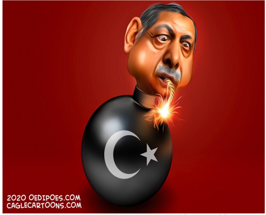
Bart van Leeuwen / Courtesy of Cagle.com