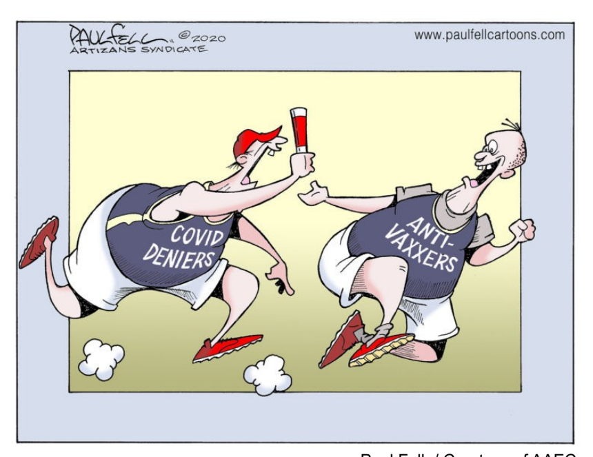
Paul Fell / Courtesy of AAEC