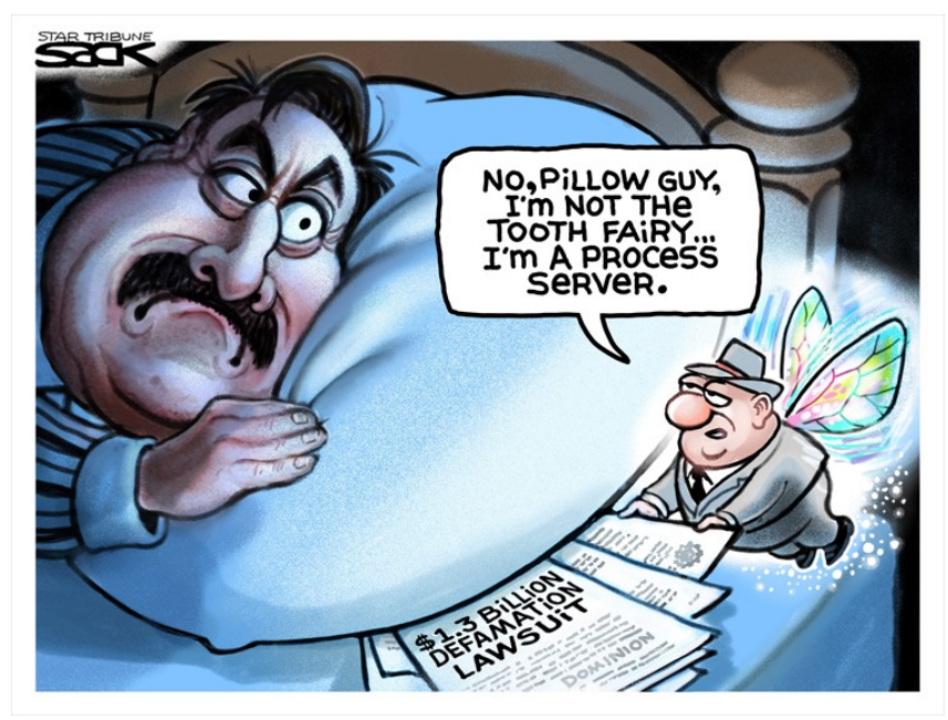
Steve Sack, The Minneapolis Star Tribune