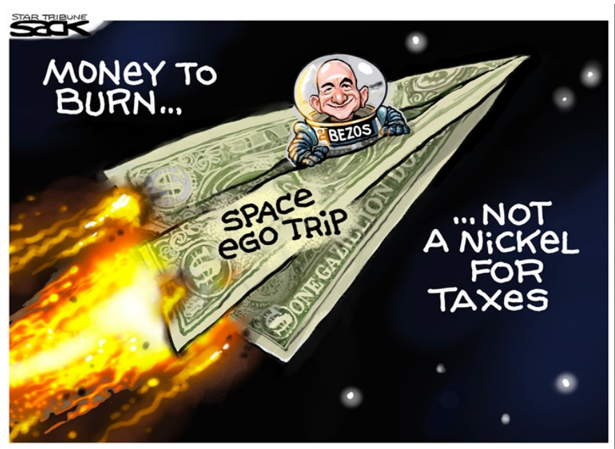
Steve Sack. Minneapolis Star Tribune