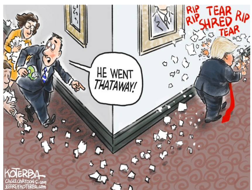
Jeff Koterba, Omaha World-Herald / Courtesy of Cagel.com

1. What do these cartoons say about reports that ex-President Donald Trump may have violated the law by destroying and taking White House documents?