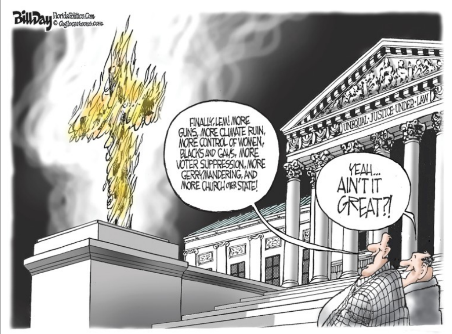
Bill Day / Courtesy of Cagle.com