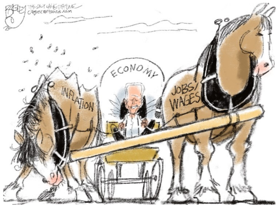
Pat Bagley, Salt Lake Tribune