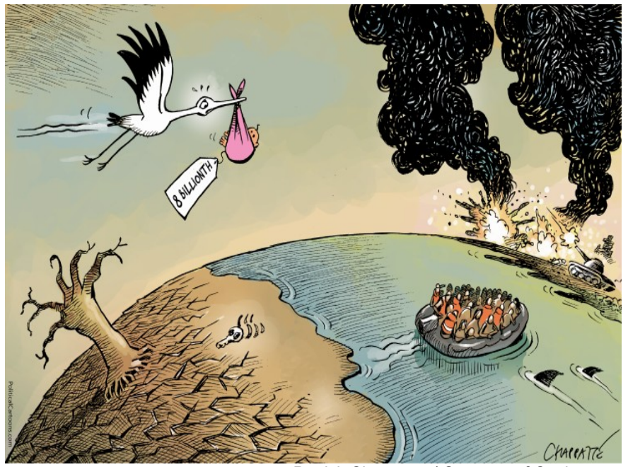
Patrick Chappatte / Courtesy of Cagle.com