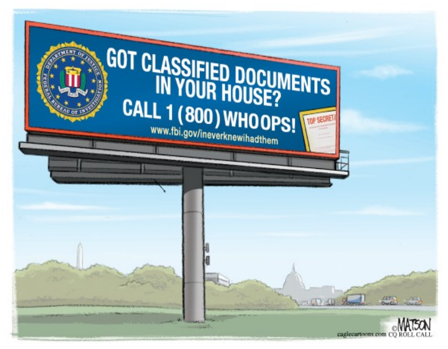
R.J. Matson, Roll Call