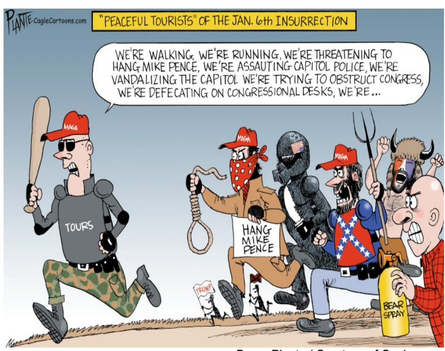
Bruce Plante / Courtesy of Cagle.com