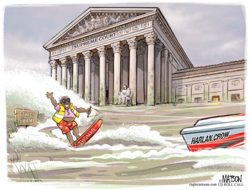
R.J. Matson, Roll Call / Courtesy of Cagle.com