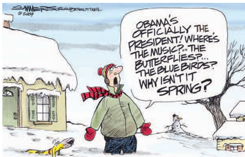
Cartoon Courtesy Dana Summers / Orlando Sentinel

More by Dana Summers http://www.orlandosentinel.com/news/opinion/columnists/orl-summers-cartgallery,0,5845995.photogallery