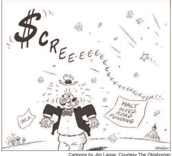
Cartoons by Jim Lange