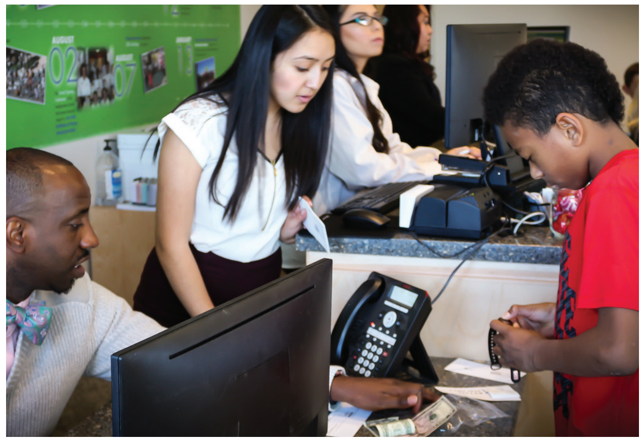
Learning about money and starting to use money at a young age is valuable because it allows time to develop responsible money habits.

Just like learning how to read or how to ride a bike, learning about money takes time. It is not something that happens all of a sudden, and it takes practice to get it right. That is why learning about money and starting to use money in a