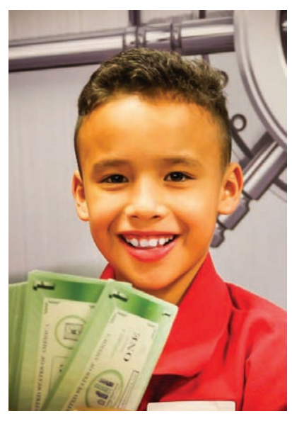
Set short- and long-term savings goals to help save more money.

hink about the things we try to do every day--brushing our teeth, eating vegetables, going to bed on time. These things help us and our bodies stay healthy. When we get sick, doing these things help our bodies get better faster.