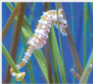
Tiny quick-draw artist

Seahorses are not the fastest swimmers among fish, but researchers at the University of Texas at Austin have found out just how quickly these little guys can move, and why they are such successful hunters. It's easy to figure out how seahorses got their name. But it turns out that their horse-shaped face is a big part of how they capture food.