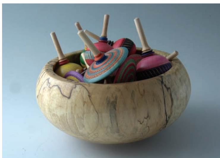
Among the wide array of hand-crafted gifts at the Holiday Art Market are these wooden tops by David Hawley.

The Art Center also holds holiday classes and events for kids including photos with Santa, gingerbread construction, holiday card