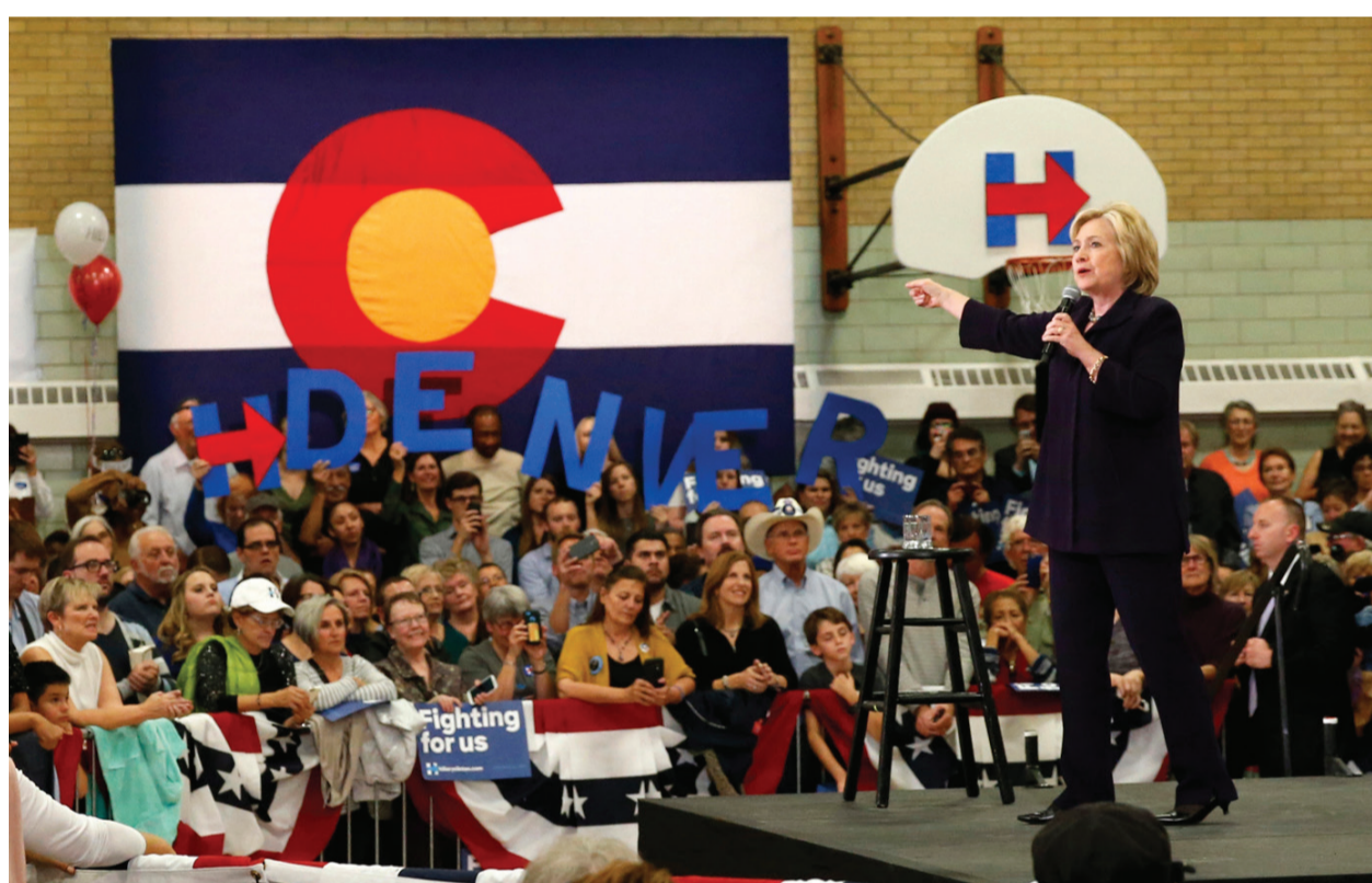
Hilary Clinton at Manual High. The candidate also appeared at the Boulder Public Library.

Secretary Clinton put a lot of emphasis on making college affordable through her