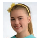
By Vivien Weigel, 12, a CK Reporter from Arvada

I suggest during these cold days of winter that you snuggle up on your couch and have some fun, designing and playing this classic game.