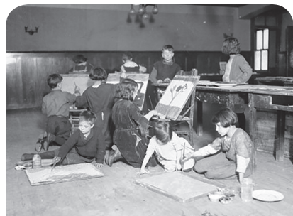
Children in an art class at Hull-House.

While visiting in Europe in 1887 and 1888, Jane Addams learned of a program in which educated young men moved into a poor section of London and offered classes and activities to people right in their neighborhoods. She thought it was such a great idea that she brought it home and founded Hull-House in the slums of Chicago.