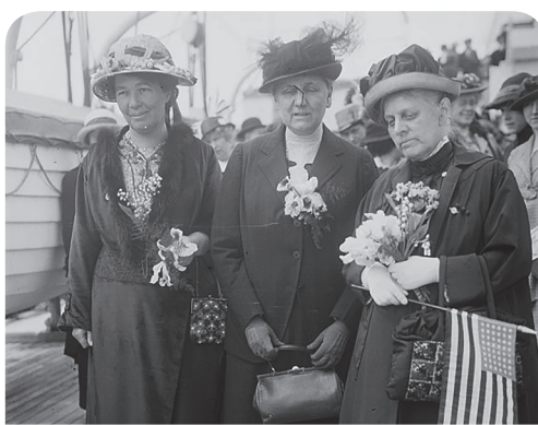
Jane Addams, center, with Emmeline Pethick-Lawrence (left) and Alice Thacher Post as they left for the 1915 International Congress of Women in the Netherlands. At the meeting, Addams was chosen president of the International Committee of Women for a Permanent Peace, which later became the WILPF.

She was the founder and first president of the Women’s International League for Peace and Freedom (WILPF). Just as she worked hard at Hull-House to help the poor, she worked hard to promote world harmony.