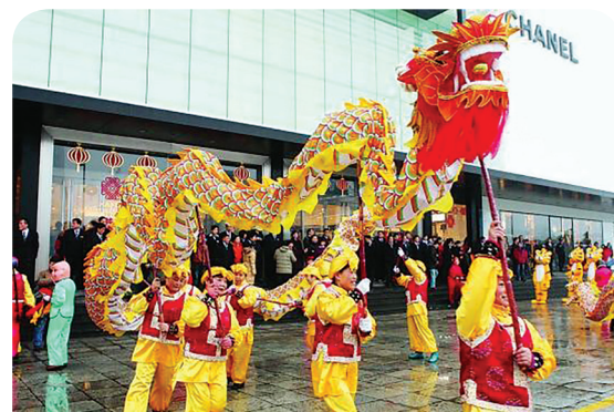
Some dragons can be 100 feet long!

This year is the Year of the Rooster. Chinese Years are named for animals; last year was the Year of the Monkey.