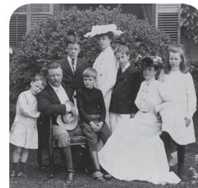
President and Mrs. Roosevelt and their children.

Edith Roosevelt moved into the White House with six children! She and President Theodore Roosevelt read to their kids every day and let them have all kinds of pets, including a snake.