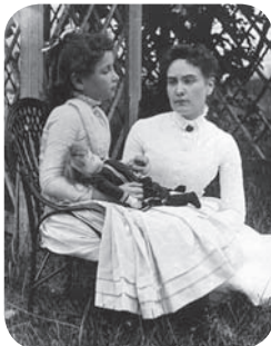
Helen, left, and Anne Sullivan in 1888.

A blind and deaf person can "read" words by feeling the hand of the other person. The person spells out words in the palm of the blind and deaf person's hand. It is very close to the sign-language alphabet that deaf people use to communicate by sight.