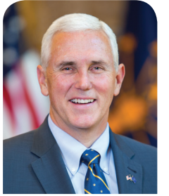
Vice president-elect Mike Pence

Pence was born in 1959 in Columbus, Indiana, one of six children. He studied history at Hanover College and earned a law degree from Indiana University. He practiced law and later hosted a radio talk show.