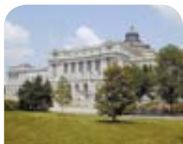
The Library of Congress in Washington, D.C.

However, the largest collection of presidential papers from most of the earlier presidents is in the Library of Congress in Washington, D.C.