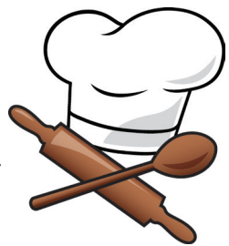
* You'll need an adult's help with this recipe.