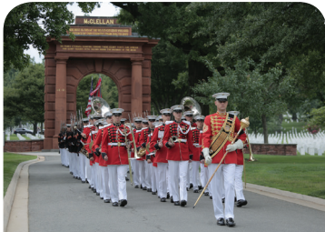
The Marine Band plays for some funerals at Arlington National Cemetery.

The mission of the U.S. Marine Band is to play for the president of the United States. The band