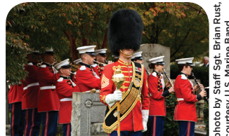
The drum major wears a special uniform and a large fur hat.

Along with a large bearskin hat, the drum major wears a fancy sash across his chest called a baldric. He uses his mace, or staff, to signal directions to the musicians.