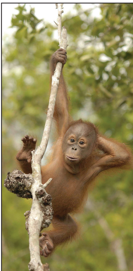
Elo is learning to climb trees in forest school.