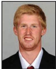
Height: 6-4 Age: 23 Hometown: Spokane, Washington

The easiest measure of success in football is a team's record in wins and losses. But the final score of a game rarely tells the entire story. Late on Oct. 4, the Washington State Cougars fell to the California Bears 60-59 when the Cougars missed a short field goal in the closing seconds.