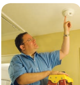
Mount alarms high on the wall or on the ceiling. Remember, smoke rises.

• W hen smoke alarms fail to operate, it is usually because batteries are missing, disconnected or dead.