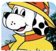
Sparky is a registered trademark of NFPA; used with permission.

It's Fire Prevention Week, so The Mini Page talked with Sparky the Fire Dog and other experts about protecting our families and homes from fire. This year's theme is "Hear the Beep Where You Sleep."