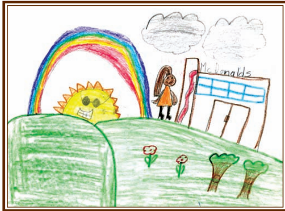
By Clarence Conners, 7, Detroit

This is the last Yak's Corner of the school year, and boy has it been fun! Your Page artists have drawn some awesome pictures, and this week is no exception. Their drawings show different ways to have fun while on summer vacation. One fun thing they don't show is drawing pictures! So keep drawing this summer, showing you, your family and your friends enjoying your vacation. See you next fall!