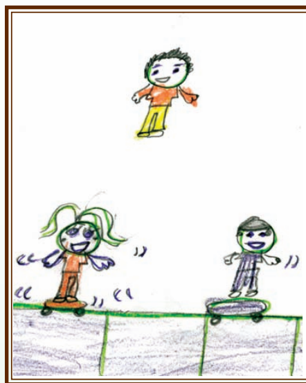
By Walter Corad, 8, Detroit