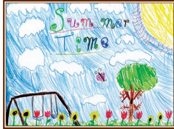
By Ronak Shrestha, 9, Troy