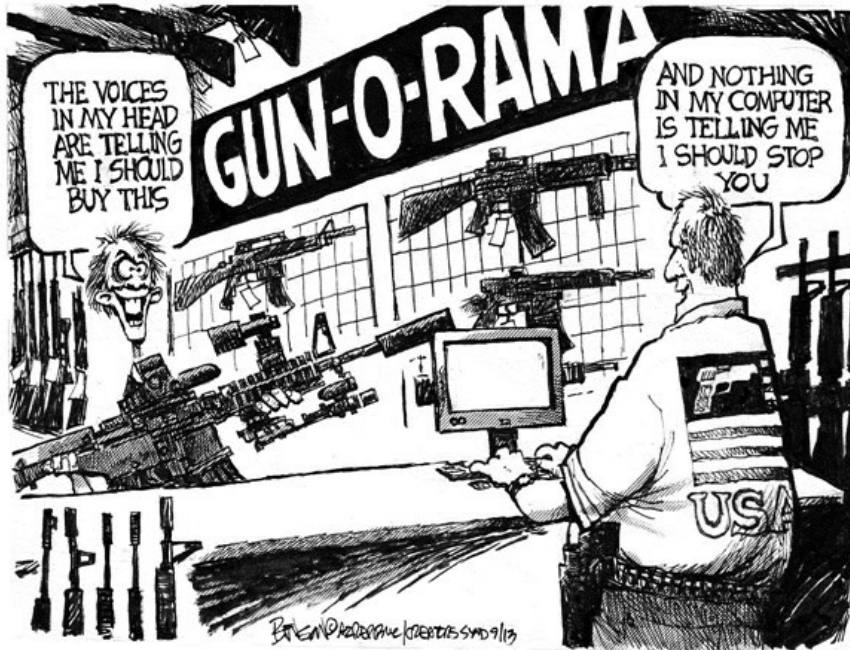
By Steve Benson, Arizona Republic