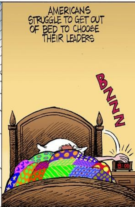
Bruce Plante, Tulsa World / Courtesy of AAEC