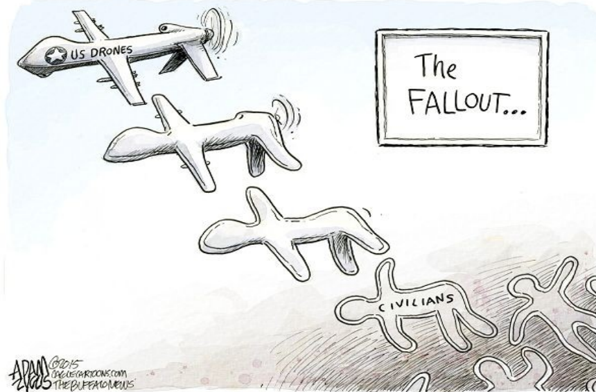
Adam Zyglis, The Buffalo News / Courtesy of AAEC