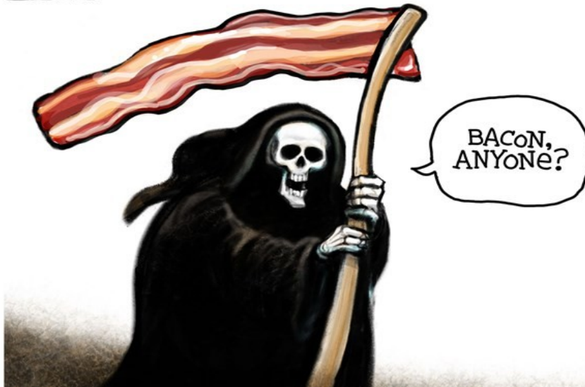
Steve Sack, Minneapolis Star Tribune