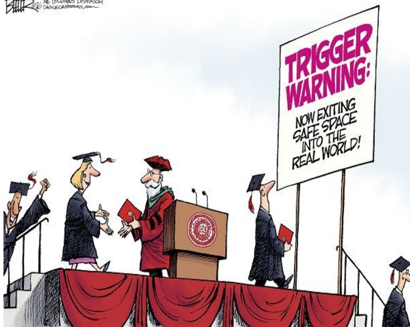
Nate Beeler, The Columbus Dispatch