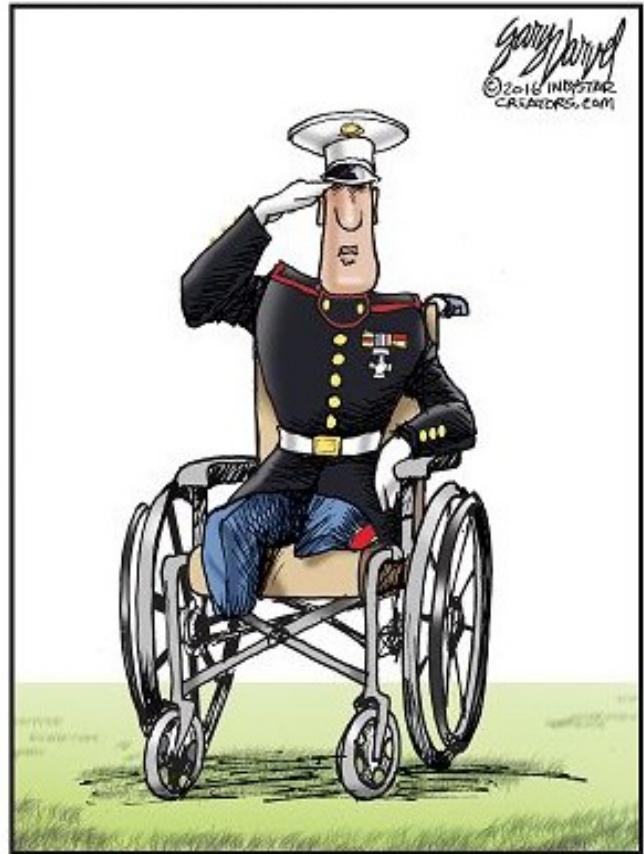
Gary Varvel, Indianapolis Star