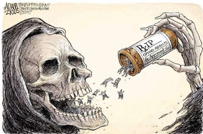
Adam Zyglis, The Buffalo News / Courtesy of AAEC