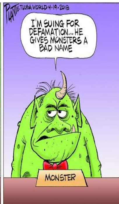
Bruce Plante, Tulsa World / Courtesy of AAEC