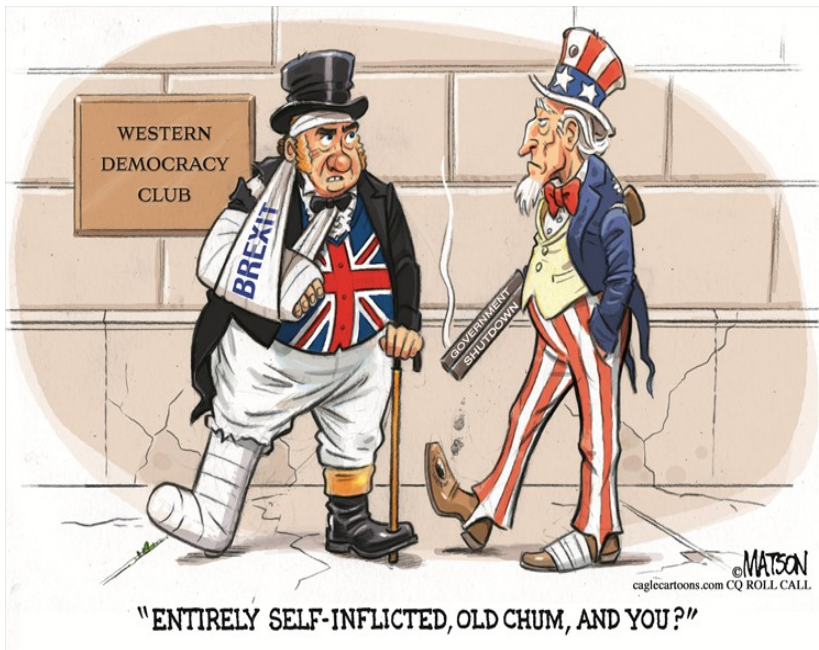
R.J. Matson / Courtesy of Cagle.com