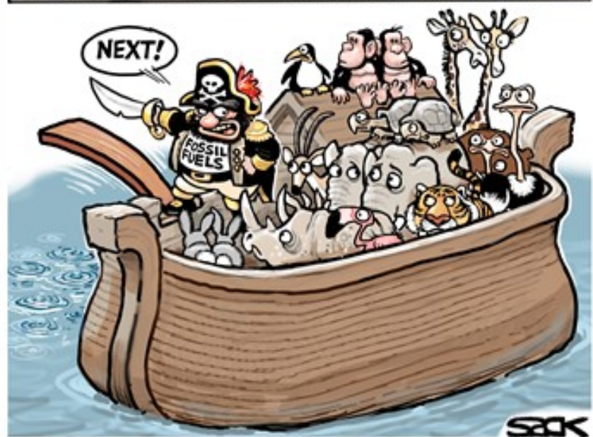
Steve Sack, Minneapolis Star Tribune / Courtesy of Cagle.com