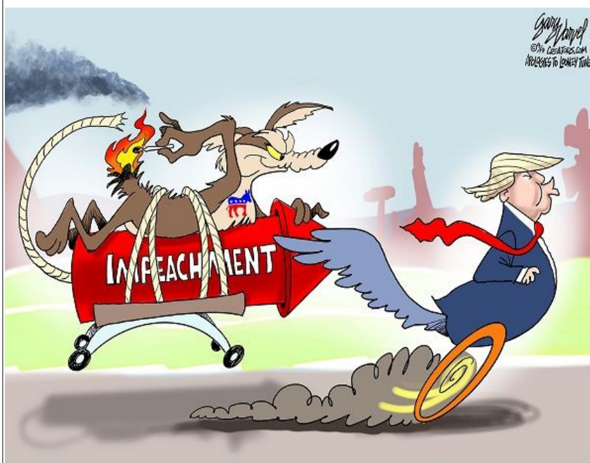
Gary Varvel, Indianapolis Star / Courtesy of AAEC